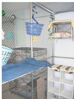
An example of colony housing with great use of vertical space and hiding areas.

“The use of cost-effective alternatives to high rates of air exchange can significantly improve indoor air quality on a limited budget.”