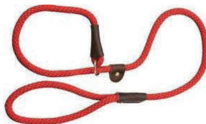
Equipment such as a British slip lead (left) for tethering and Assess-a-Hands® (above) are invaluable tools for use in conducting canine behavior evaluations.